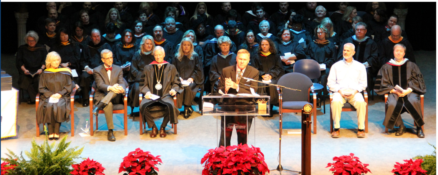
Above: 2019 Graduation at Southeastern Technical College

3001 E. First Street Vidalia, GA 30474 (912) 538-3100