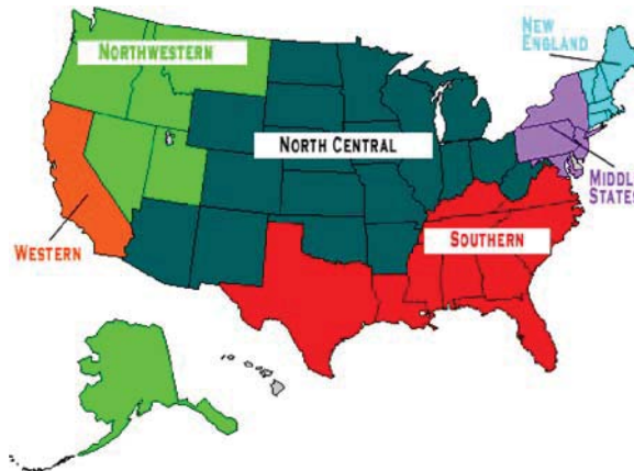
Figure 1: The Six Accrediting Regions